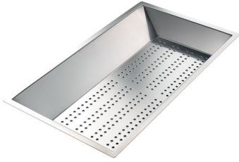
Stainless steel perforated tray